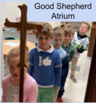
Good Shepherd Atrium