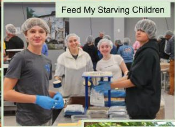
Feed My Starving Children