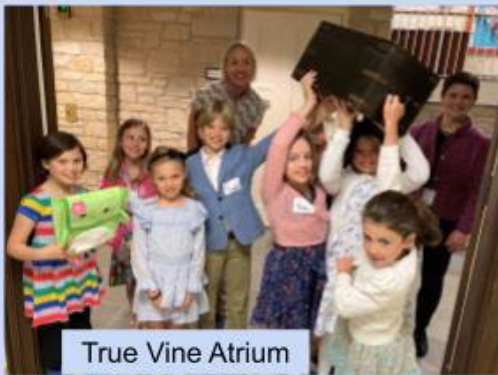
True Vine Atrium