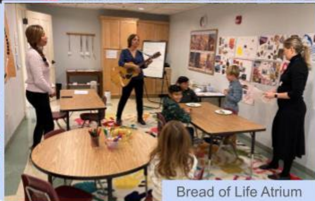
Bread of Life Atrium