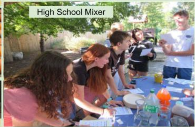
High School Mixer