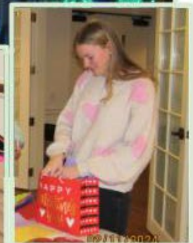
Valentine's Service Project