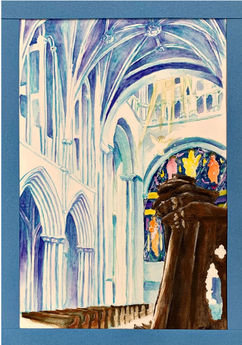
Watercolor by Tara Maclachlan, inspired by the cover artwork of an anthem she has sung in our Youth Choir.