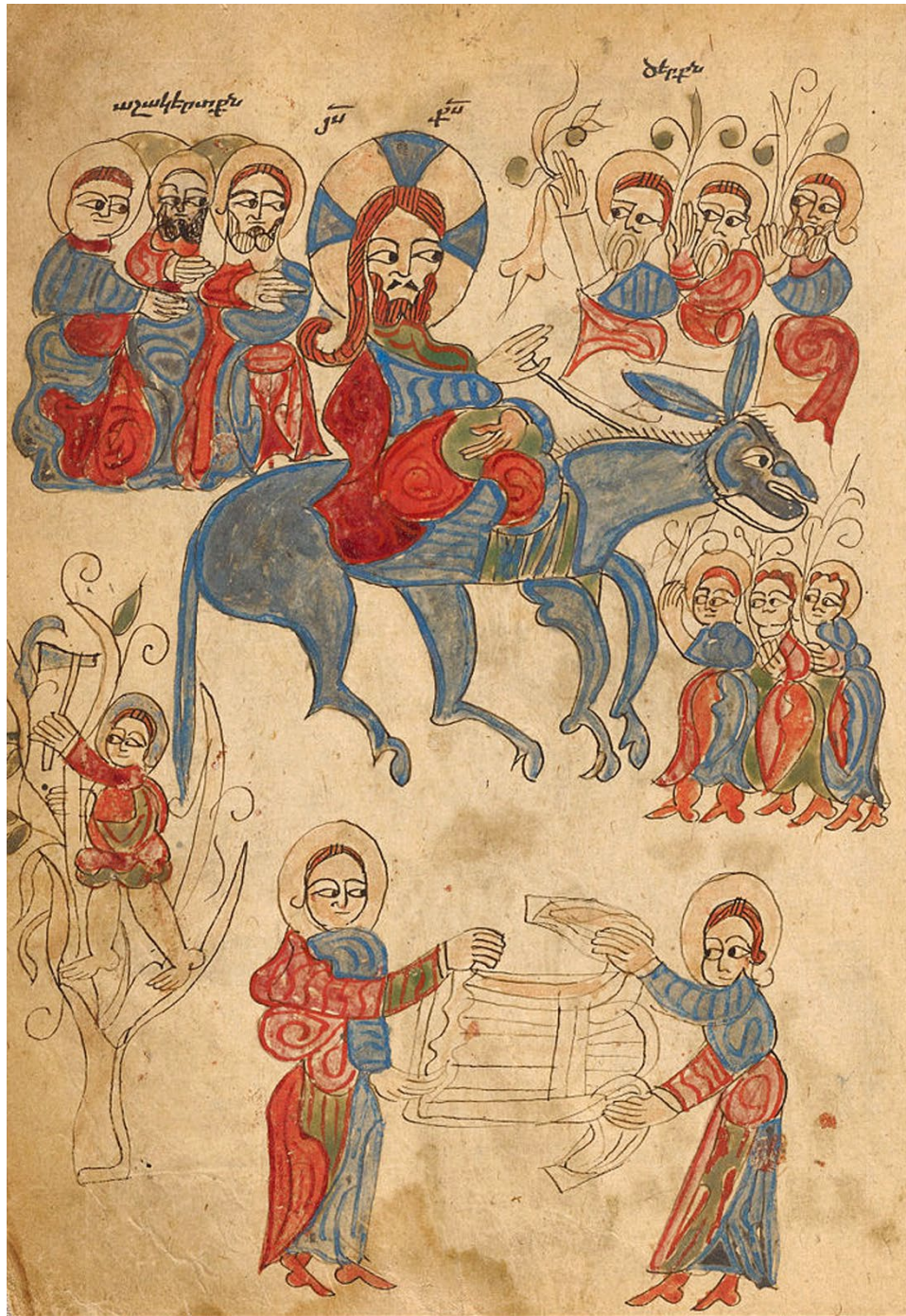
The Entry into Jerusalem; Lake Van, Turkey, 1386.

Black ink and watercolors on paper bound between wood boards covered with dark brown kidskin.