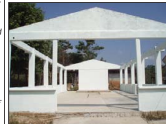
Start of the new parish house. Such a nice shade of white!

During his sermon, Padre thanked the group from Christ Church for traveling so far to be with them for the week. He expressed his gratitude for their hard work, for the painting and the cleaning, the scraping and the caulking. He also reminded everyone that the building is but one part of the church. Pointing to person after person seated in the modest pews, he said, "You are the church, and you are the church, and you are the church. Together, we are the church." Yes, together we are the church. No translation needed.