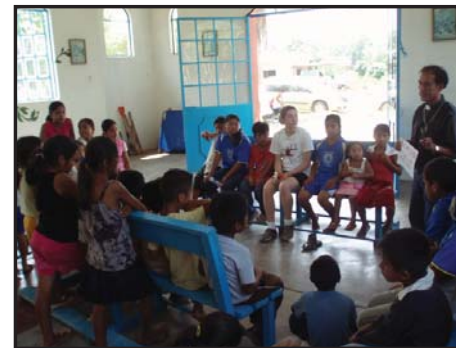
Padre holds an impromptu bible study class.